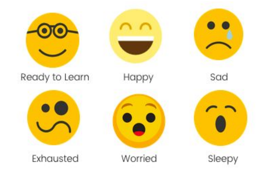
Exit ticket: How are you feeling?